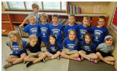
Kindergarten Crew in training for First Grade!

Don't forget, no matter what grade your student is in, set aside time each day to review the skills learned during the school year. Some ideas include: play Would You Rather ; get outside and explore; practice Fluency whether is letters, words, sentences, or even chapters; take time to write and color; try an outdoor Science Project or two; review your math skills; do a puzzle; READ... studies show that reading six books (together as a family or individually) over the summer can help prevent the summer slide.