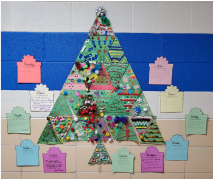
Our Kindergarten Geometric Christmas Tree! (along with some of our Positively Proud Parent presents)