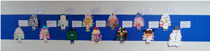
Our classroom "Disguise a Turkey!"

I have been trying to think what to write about and share with our school community...we are halfway through our school year. The kids can't wait as the Hundredth Day of School is just around the corner. We are in the middle of assessments and it is fun to see their growth! In Kindergarten, we are continuing to work our way through our letter sounds, recognizing our numbers (those double digits are hard ). We are also learning about how authors and illustrators work together to tell a story. With so much going on, it is difficult to know what to share. Then I remembered that this month's habit is Put First Things First . What I want to put first is THANKING all our families for what they do! There is so much learning that goes on during our day, I just want to thank you for sharing those experiences at home too. We have sent home a couple of projects this year (and another will be on its way soon). I hope you enjoy the experience as much as your child does, they LOVE sharing what they created and seeing it on display!